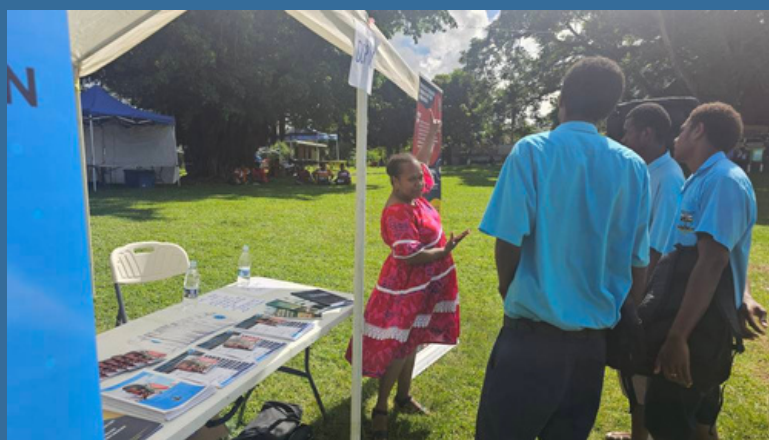
DSPAC booth at Labour Day Celebrations

All 13 line government ministries set up informative booths to highlight their different roles in supporting economic growth and sustainable development.