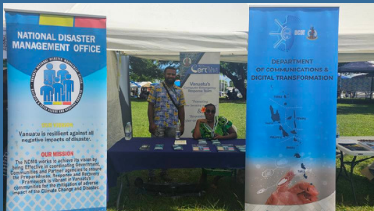
Department of Communication & Digital Transformation booth at Saralana

Labour Day, organized by the Labour Department Vanuatu on May 2 nd 2025, is a significant event that highlights the contributions of workers across various sectors, bringing together all 13 ministries involved in labor, employment, and social welfare.